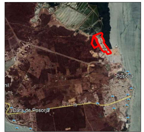
UBICACIÓN GEOGRÁFICA ESCALA: 1 - 100.000